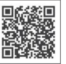
LEARN ABOUT THE AUTHORS OF OUR PARISH COMMUNITY

The community/communion of the triune God—Father, Son, and Holy Spirit—is the perfect witness to the truth that mystery creates. One God, three divine persons. The Eucharist that we celebrate on this day proclaims the unity of our belief—to the Father, through the Son, by the power of the Holy Spirit. ●