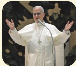
MARCO JACOBELLI EPI / SHUTTERSTOCK

GENERAL AUDIENCE, ROME, SEPTEMBER 24, 2025