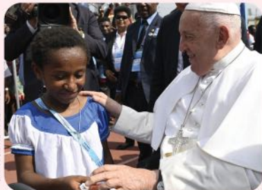
CATHOLIC NEWS SERVICE